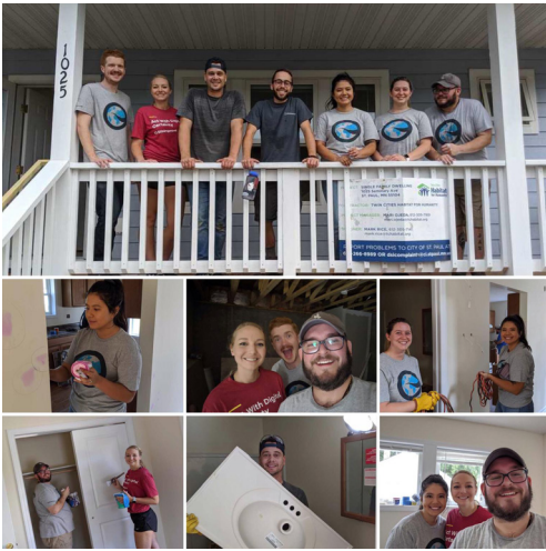
Siteimprovers volunteering for Habitat for Humanity

While the amount of donated hours topped 400 in 2018, we saw a big increase in engagement this year. In total, Siteimprovers spent 556 working hours supporting a wide range of charitable causes in the local area!