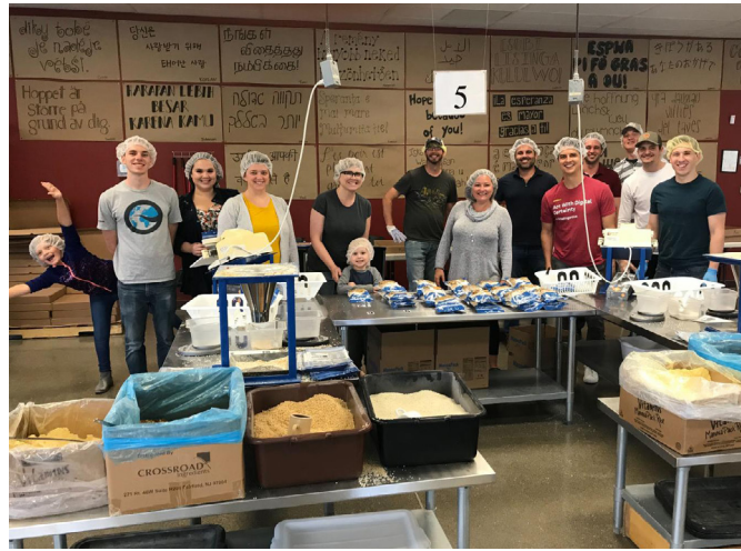
Siteimprovers volunteering for Feed My Starving Children